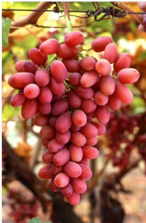
In grapes, application of gibberellic acid increases the size of fruit and loosens clustering.

GAs break dormancy (a state of inhibited growth and development) in the seeds of plants that require exposure to cold or light to germinate. Abscisic acid is a strong antagonist of GA action. Other effects of GAs include gender expression, seedless fruit development, and the delay of senescence in leaves and fruit. Seedless grapes are obtained through standard breeding methods and contain inconspicuous seeds that fail to develop. Because GAs are produced by the seeds, and because fruit development and stem elongation are under GA control, these varieties of grapes would normally produce small fruit in compact clusters. Maturing grapes are routinely treated with GA to promote larger fruit size, as well as looser bunches (longer stems), which reduces the instance of mildew infection ( link ).