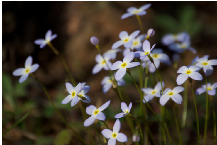
Azure bluets (Houstonia caerulea) display a phototropic response by bending toward the light.

In their 1880 treatise The Power of Movements in Plants , Charles Darwin and his son Francis first described phototropism as the bending of seedlings toward light. Darwin observed that light was perceived by the tip of the plant (the apical meristem), but that the response (bending) took place in a different part of the plant. They concluded that the signal had to travel from the apical meristem to the base of the plant.