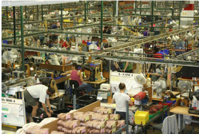
Division of Labor

manufacturing factory, such as the shoe factory shown in [link] , or a hospital can have hundreds of job classifications.