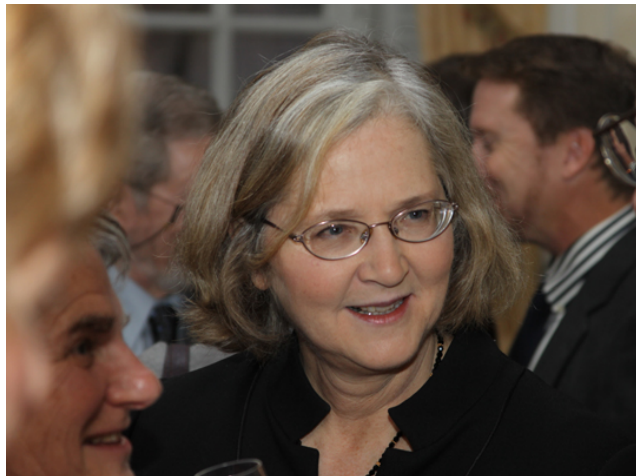
Elizabeth Blackburn, 2009 Nobel Laureate, is the scientist who discovered how telomerase works.

Telomerase is typically active in germ cells and adult stem cells. It is not active in adult somatic cells. For her discovery of telomerase and its action, Elizabeth Blackburn ( [link] ) received the Nobel Prize for Medicine and Physiology in 2009.